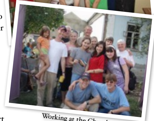
Working at the Church

where the gospel was consistently and clearly communicated. By the end of the night, the girls were ready to put their trust in Christ as their Savior! It was such a precious moment as we prayed with those six wonderful young ladies whose eternal destiny has been forever changed!