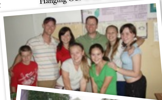
Hanging Out at the School

We had a couple of work projects going on at the church in Novogremyachenskoye. While at the school for lunch, we invited the students to come and join us at the church. They had a great time working in the garden. That evening they were able to come to a concert