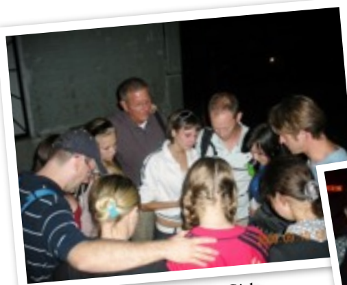
Praying with the Girls

where the gospel was consistently and clearly communicated. By the end of the night, the girls were ready to put their trust in Christ as their Savior! It was such a precious moment as we prayed with those six wonderful young ladies whose eternal destiny has been forever changed!